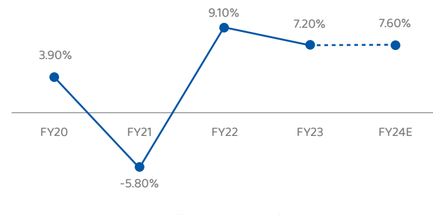
India's GDP Growth

India is one of the fastest-growing major economies in the world, with its GDP expanding by 7.6% in FY 2023-24. The Indian economy has shown resilience while navigating various headwinds in the reported financial year. India's robust performance can be attributed to a combination of various factors, including solid economic fundamentals, healthier balance sheets across banks and corporations, fiscal discipline, stable external balances and substantial foreign exchange reserves.