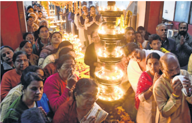
Malayalee devotees offering prayers on Makaravilakku festival at Lord Ayyappa Temple, Shivaji Nagar on Wednesday

A four-day mega Pongal Food Festival will be held at Palash Residency from January 15 to 18. Guests attending the festival will be welcomed according to South Indian traditions, and special Pongal dishes will be served on banana leaves. Similarly, guests will be able to enjoy kite flying along with traditional dishes at Wind & Waves.